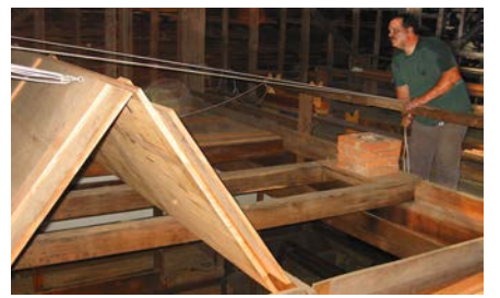
Pully operated shutter, installed in 1998