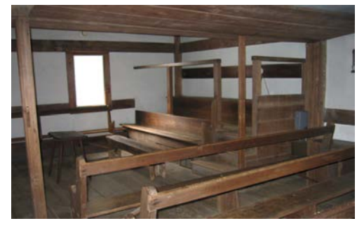
Interior of the 1758 Randolph Meeting House

To donate to the preservation of this historic site, please visit our webpage www.randolphmeetinghouse.org