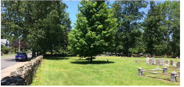
Area inside west wall that could be used for parking