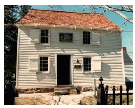
Meeting House ca. 1978, with new shake roof and before the paint was stripped

...see inside for how we plan to meet this challenge