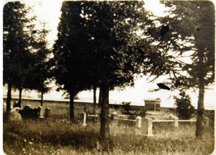
1906 postcard showing Brotherton (left) and Dell (right) markers

To convey the importance of the Cemetery to visitors, two stories need to be told. The first is the evolution of burial customs from 1758 to present-day practice. The second is the multi-chapter story of the individuals buried in the Cemetery.