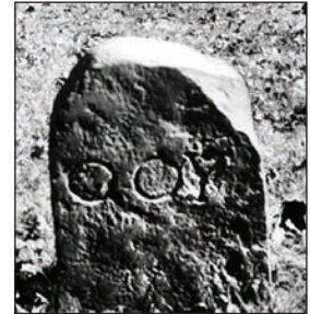
Who/what is "OOY"?

Without any doubt, the most puzzling marker in the Cemetery is the small stone near the Dell markers with the apparent letters: "OOY." It has been suggested that this stone could mark the burial of a freed slave or Native American, but there is no evidence to support either suggestion. If you have other suggestions or other information about the Cemetery, send them to: editor@randolphmeetinghouse.org .